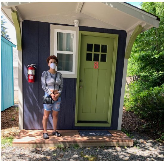
One of our new guests in front of their house

We welcome referrals for guests from outside sources such as: Community organizations + non profits, churches, and self referrals. If you know someone looking for a temporary place to call home, while seeking support and services, please send them our way!